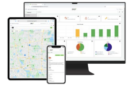
Manage and configure Digi TX40 5G with Digi Remote Manager