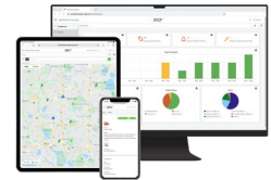
Manage and configure Digi TX40 5G with Digi Remote Manager