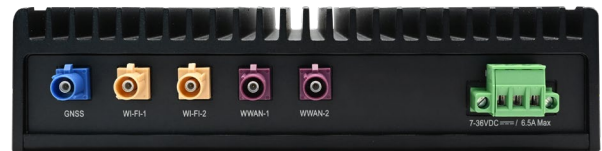
DIGI TX40 5G — BOTTOM